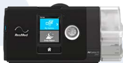
ResMed Air 10