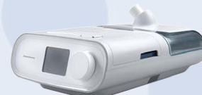
Philips DreamStation 1