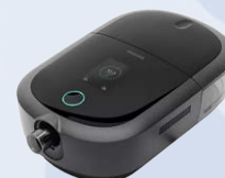
Philips DreamStation 2